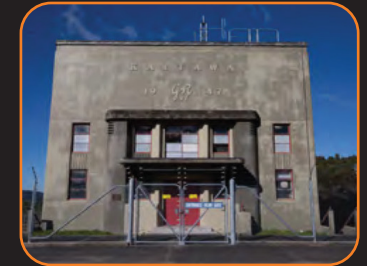
KAITAWA POWER STATION (36 MW)