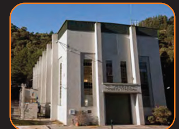
PIRIPAUA POWER STATION (42 MW)